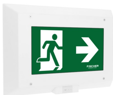
Figure | Dimensions