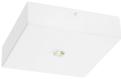
Figure | Dimensions